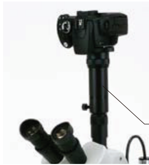
DG Adapter for SLR cameras (requires camera- specific T-mount adapter)