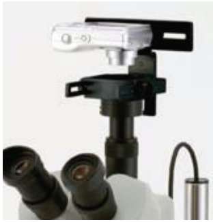
Z1018 Adapter for compact cameras