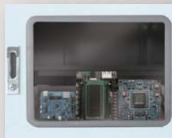
Bin is inside the door.

Bins can be installed or replaced within 10 seconds. Maximum loading of bin: 5kgs