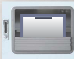
Bin is outside the door.